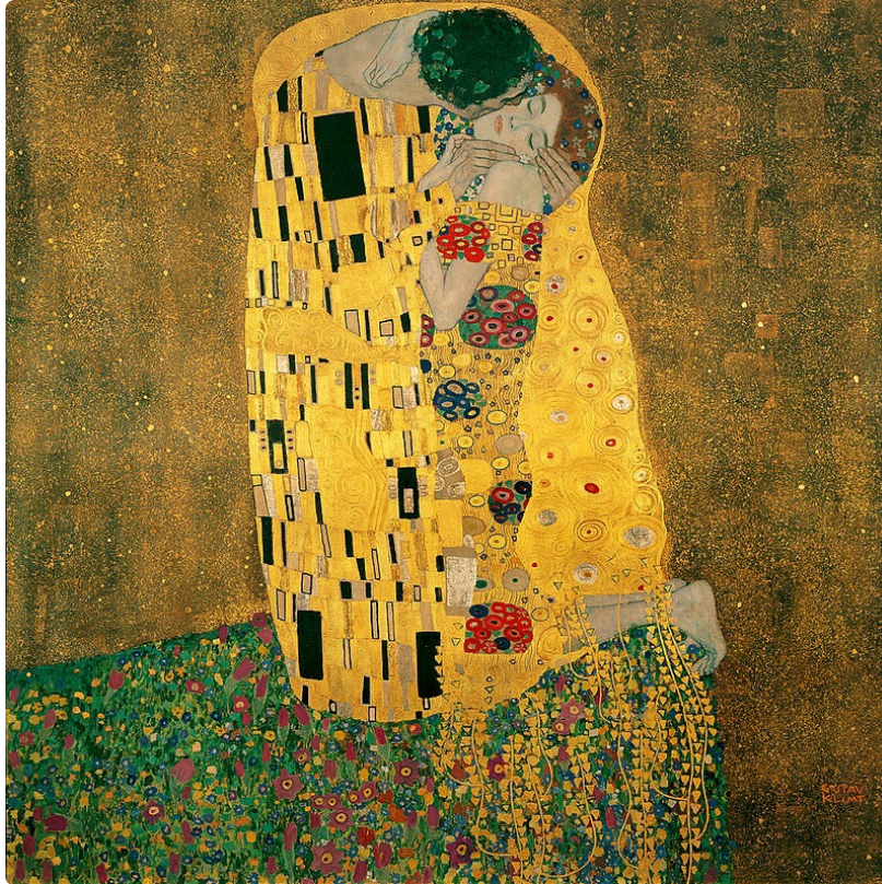
The Kiss 1908 oil on canvas